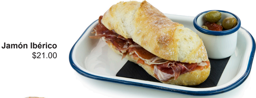
Jamón Ibérico $21.00