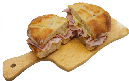
Cooked ham double toastie Cooked ham with melted Mahón cheese $17.50

Stall 45, South Melbourne Market, Corner Coventry & Cecil Street South Melbourne VIC 3205