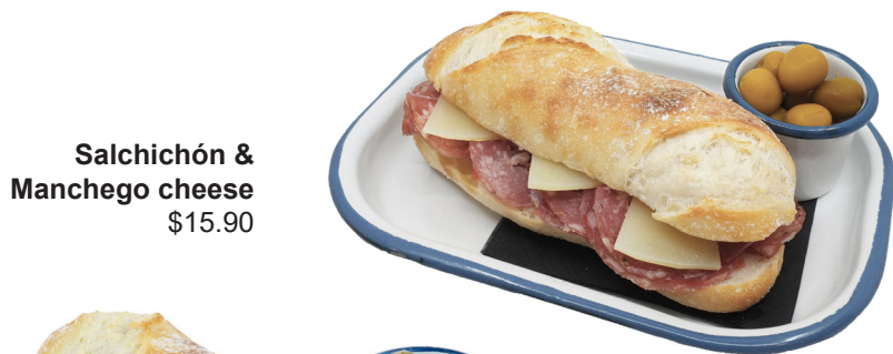
Salchichón & Manchego cheese $15.90