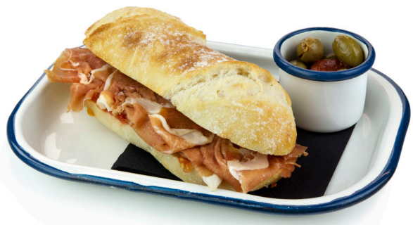
Jamón Serrano $15.90