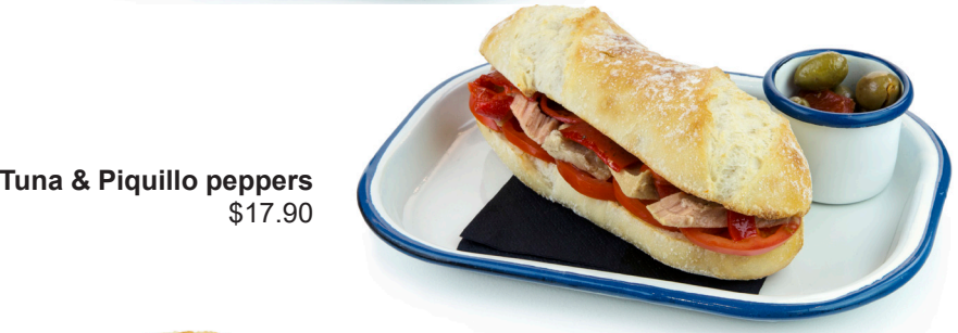
Tuna & Piquillo peppers $17.90