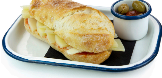
Manchego cheese (veg) $15.90