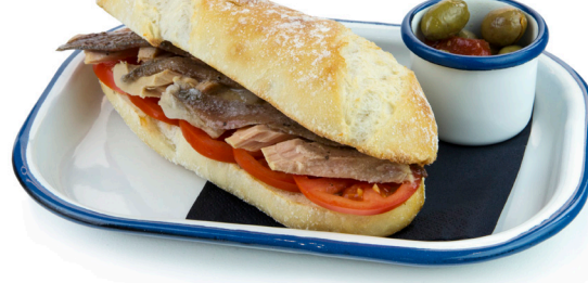
Tuna & anchovy $22.80