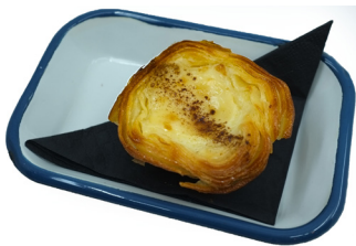
Portuguese tart $6.90