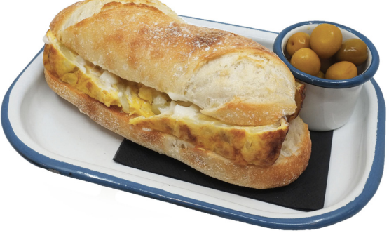
Tortilla de Patatas & Aioli (Spanish omelette) $15.90