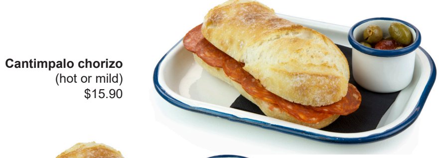
Cantimpalo chorizo (hot or mild) $15.90