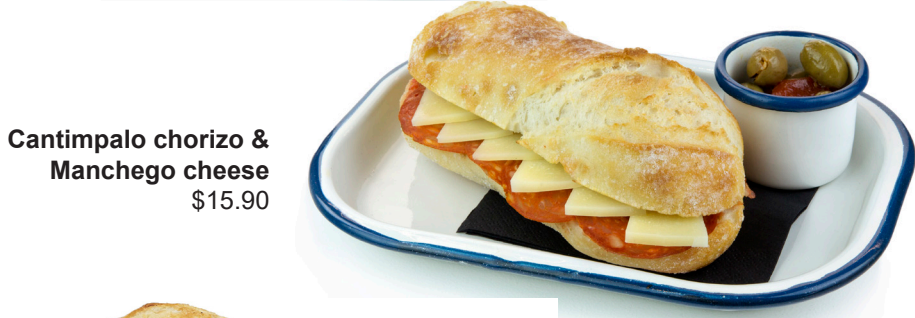
Cantimpalo chorizo & Manchego cheese $15.90