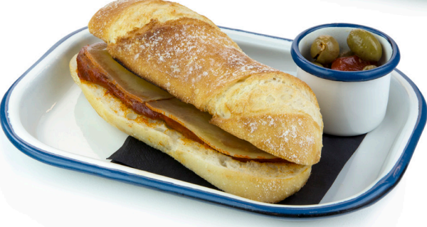
Sobrasada, Mahón cheese and honey (no tomato) $15.90