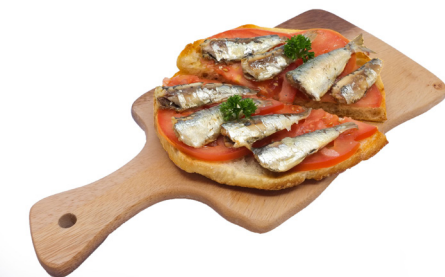
Baby sardines toastie Baby sardines in olive oil with sliced tomato $17.50