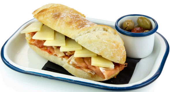
Jamón Serrano & Manchego cheese $15.90

Bocadillos: Filled Spanish bread rolls. Our bread is rubbed with fresh ripened tomatoes in a traditional spanish way.