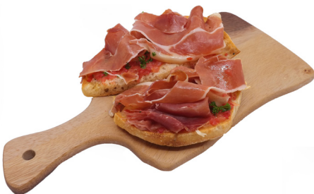
Jamón Serrano toastie Serrano ham and rubbed tomato bread $16.90

Tostas: Grilled crispy Laurent bread, with different toppings served toasty warm