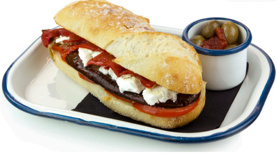
Goat's cheese, grilled eggplant & Piquillo peppers (veg) $17.80