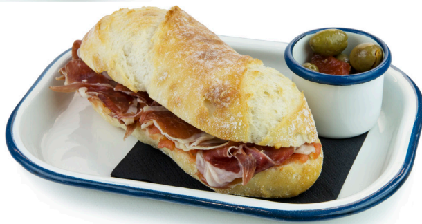
Jamón Ibérico $19.80