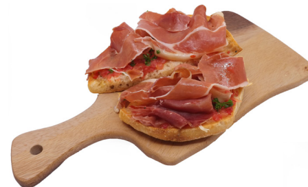
Jamón Serrano toastie Serrano ham and rubbed tomato bread $15.90

Tostas: Grilled crispy Laurent bread, with different toppings served toasty warm