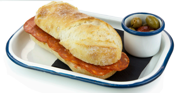
Cantimpalo chorizo (hot or mild) $14.90