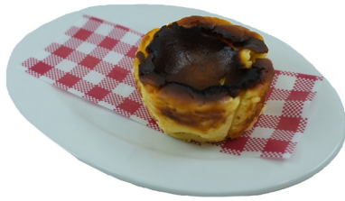
Basque Country cheesecake $9.90