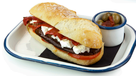
Goat's cheese, grilled eggplant & Piquillo peppers (veg) $16.80