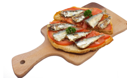
Baby sardines toastie Baby sardines in olive oil with sliced tomato $16.50