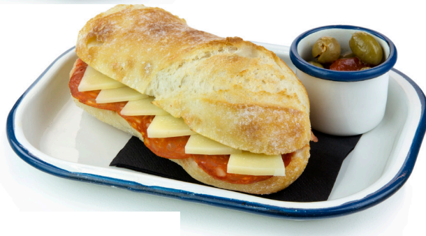
Cantimpalo chorizo & Manchego cheese $14.90