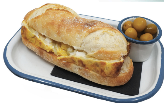
Tortilla de Patatas & Aioli (Spanish omelette) $14.90