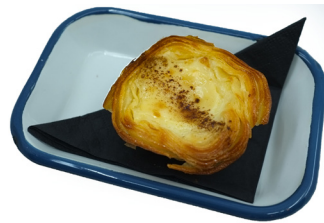
Portuguese tart $5.90