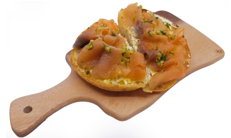
Smoked salmon toastie Smoked salmon, cream cheese and dill vinaigrette $17.50