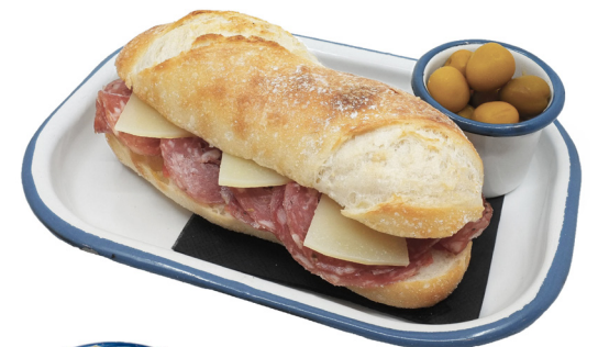
Salchichón & Manchego cheese $14.90