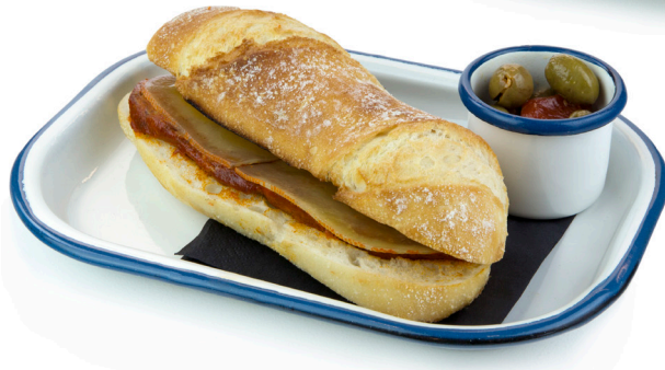
Sobrasada, Mahón cheese and honey (no tomato) $14.90