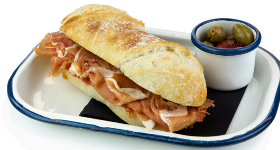
Jamón Serrano $14.90