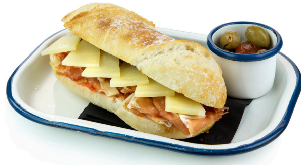
Jamón Serrano & Manchego cheese $14.90

Bocadillos: Filled Spanish bread rolls. Our bread is rubbed with fresh ripened tomatoes in a traditional spanish way.