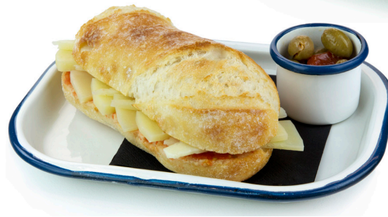
Manchego cheese (veg) $14.90