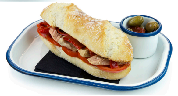
Tuna & Piquillo peppers $15.90