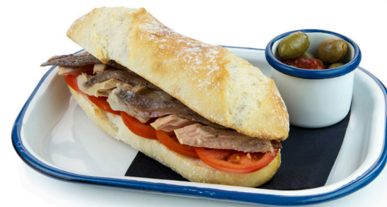
Tuna & anchovy $19.80